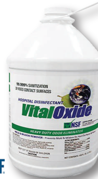
GEN993 - 4/1 Gallon/Case GEN1007 - 2.5 Gallon Bag-in-a-Box