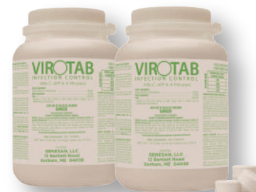
GEN1112 Case: 2-120/tablet Tubs (240 tablets)

Non-irritant/Non-corrosive/Non-quaternary HMIS Triple Zero rating Food Contact & Pet Safe Spray Bottle/Mop or Electrostatic Sprayer